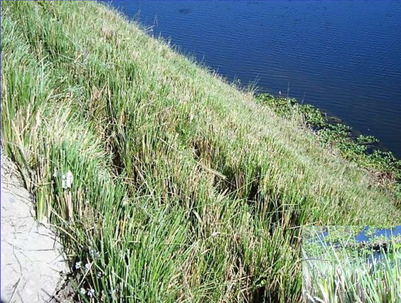
Doria Bridge approach, two years after planting (2010)